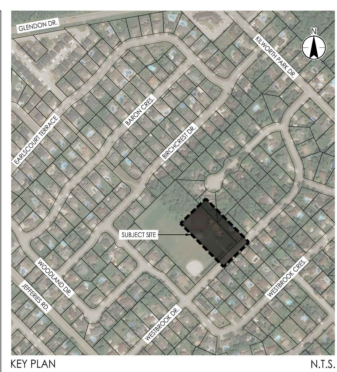
KEY PLAN N.T.S.